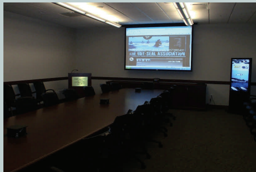
Executive Style Conference Room