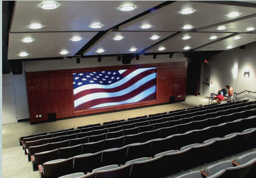
Seal Heritage Center - New Auditorium/Theater

In September 2010, the iSoft Team completed the audio-visual design and integration solution for the new "Seal Heritage Center" at JEB Little Creek Naval Amphibious Base. The iSoft Team provided a large auditorium/theater with a 17'6" wide rear screen powered by dual 6000-lumen edge blended projectors.