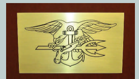
Custom brass podium logo

"This facility honors those who have braved and even embraced the cold, wet and dark, and who have faced our enemies with almost unbelievable courage," said Admiral Eric Olson, Commander of the U.S. Special Operations Command.