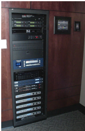
AUDITORIUM - In-wall equipment rack, Crestron control panel & iPod interface

The iSoft Team also designed and installed a large executive conference room with custom AV furniture, a large event hall, an activity room, several digital signage displays, and office TVs throughout the facility. Multiple connections for computers and other peripherals were provided, and simple control was